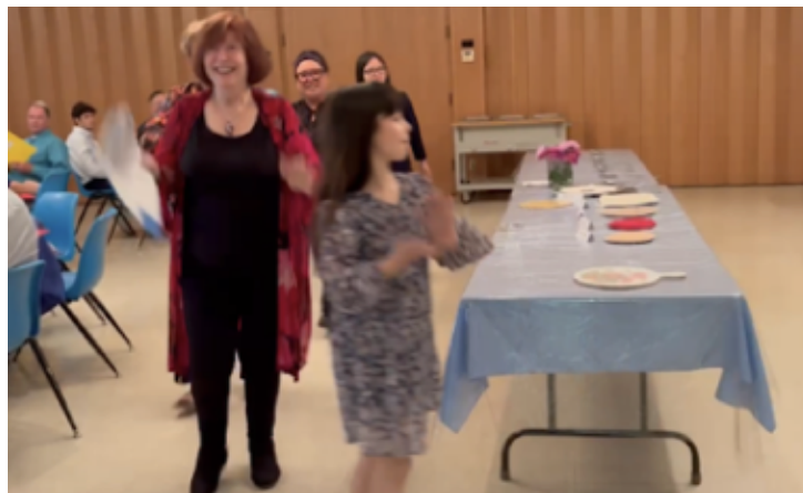
Dayenu Conga Line!