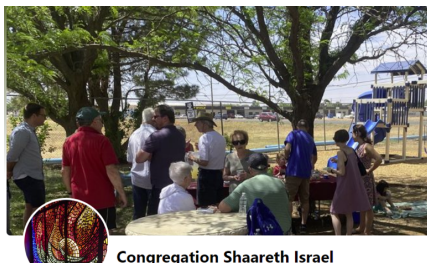
Congregation Shaareth Israel

We are on Facebook Check us out. https://csitemple.org