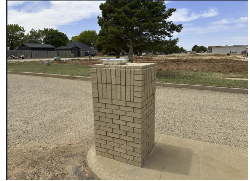
Special Delivery: Tzimmes for the Seder!